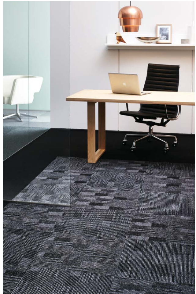
▲ GA5604/GA4031 (GA-400 · page 78)