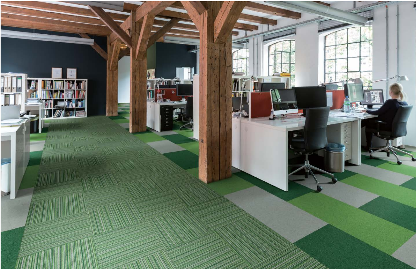
▲ GA5557/GA4039/GA4041/GA4042 (GA-400 - page 79)