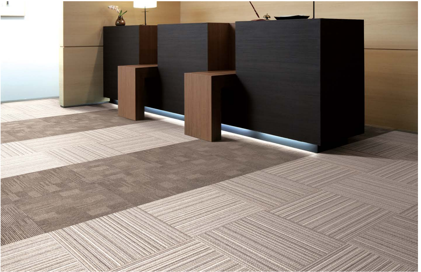
▲ GA5556/GA5601 (GA-560 - page 88)